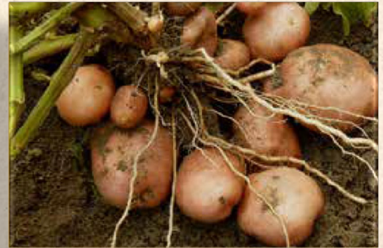
Germany, 2023, private Farmland