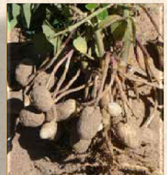
Senegal, Peanuts, ISRA