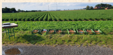
Test area at 31.07.2023