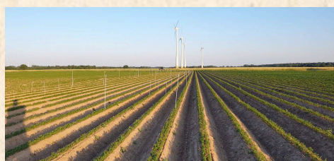
Visselhövede, 14. September 2023