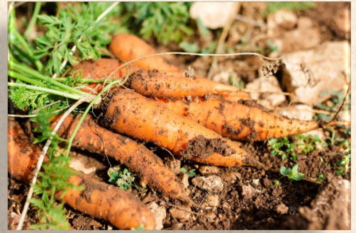
Germany, 2023, private Farmland