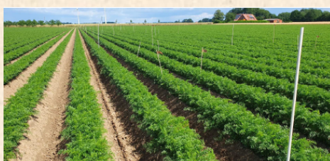
Test area at 27.06.2023,