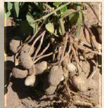
Senegal, Peanuts, ISRA